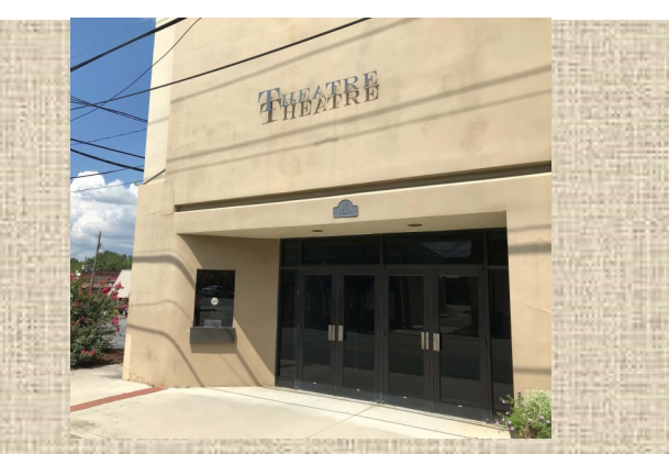
We thank you for your patronage of the Arts in RockmART!