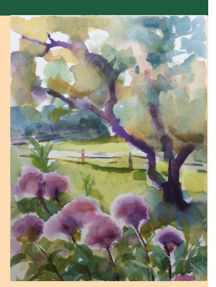
Joe Pye Weed, watercolor

I pray you are safe, healthy and finding creative ways to cope with social distancing during this time. I hope the Visual, Performing and Literary Arts are helping bring calm, focus, and cheer in your life. Keep being creative and stay positive. All will work out and we will be together again with a renewed appreciation for one another.